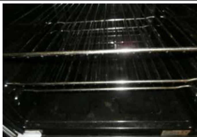
Main Oven Compartment