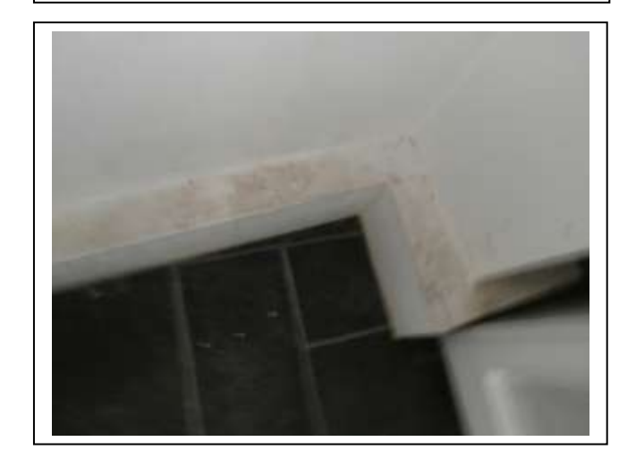
Kitchen Skirting Board