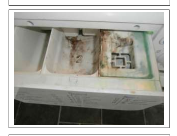
Washing Machine Dispenser