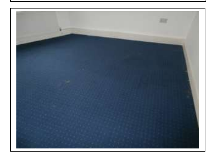
Bedroom 3 Carpet