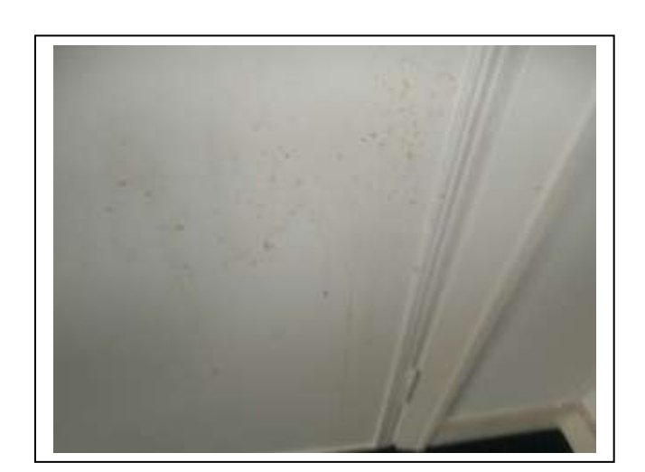
Lounge Area Wall